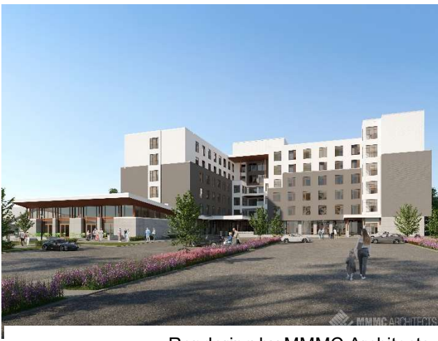
Rendering by MMMC Architects