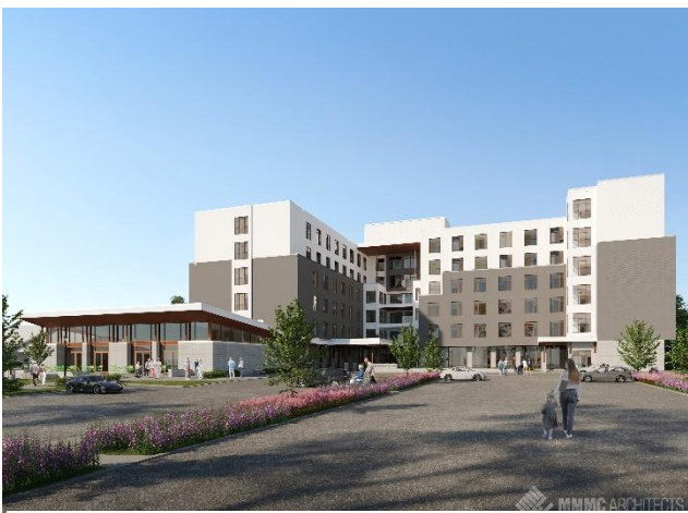
Rendering by MMMC Architects